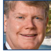
State Assembly - Dist 29 Mark Stone (D) Assemblymember