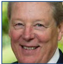
State Senate - Dist 17 Bill Monning (D) State Senator