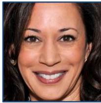
US Senate Kamala D. Harris (D) Attorney General of California