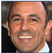
US House - Dist 20 Jimmy Panetta (D) Deputy District Attorney