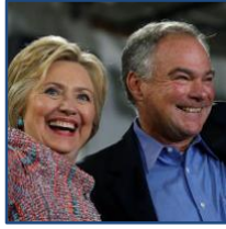
President - Vice President Hillary Clinton - Tim Kaine (D)